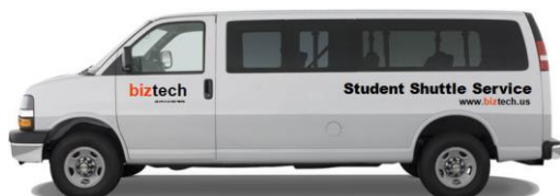
Free Shuttle Service